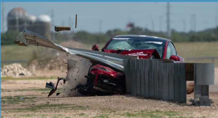
TTI researchers subjected a Tesla Model 3 to a 62-mph impact at a 25-degree angle with a thrie beam guardrail system – the same conditions used for MASH crash testing. The impact ruptured the thrie beam rail and allowed the test vehicle to penetrate through the barrier.